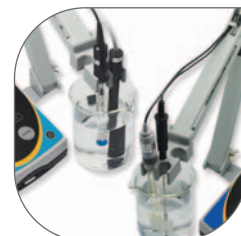
Integrated electrode holder – can be used on either side