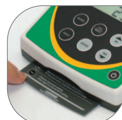
Quick reference guide